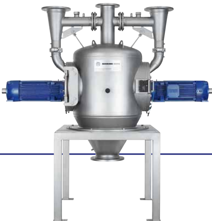
➤ Sugarplex 315 SX Twin