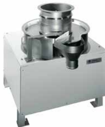
➤ Bextruder low pressure extruder

If the desired end product is an extrudate, the Flexomix can be placed in front of a Bextruder (low pressure extruder). The Flexomix's aerated mixing effect results in a very homogene (evenly wetted) and fluffy product, which is easily extruded. In addition, the end product quality is increased, which is shown by a better dispersibility of the extrudates.