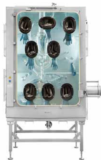
➤ Isolator with 315 AS spiral jet mill

Hosokawa leads the market in the development of bespoke engineered powder processing equipment for integration within containment enclosures and the design, manufacture and installation of ultra high containment facilities capable of achieving nanogram containment levels.