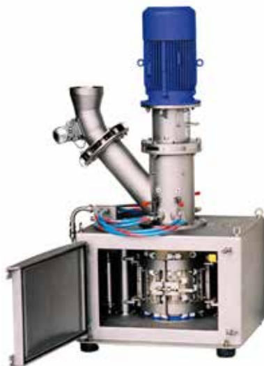
➤ Flexomix continuous mixer/agglomerator

The agglomerates can be produced in the Flexomix where the product is introduced as a powder. A liquid binder is added by nozzles. There is no need to make a slurry out of the product as with a spray dryer. The amount of liquid needed typically is half the amount of liquid needed to obtain a workable slurry for a spray tower.