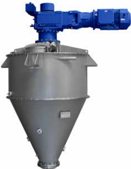
› Conical Paddle Mixer (CPM)

The Nauta® mixer is a low shear, gentle mixer, suitable for temperature sensitive and abrasive products. The CPM is a low and mid shear mixer. Both mixer types are suitable as live hopper after milling and provide a full product discharge.