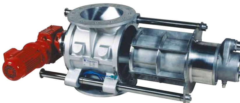
➤ Denspack rotary valve