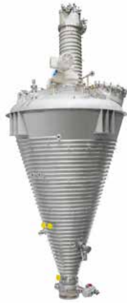
› Nauta® conical screw dryer (batch)

Hosokawa Micron's range of vacuum dryers includes the Nauta® conical screw dryer and the conical paddle dryer (CPD), each with their own specific features and advantages. Both dryer types allow for a contained process, solvent recovery, cleaning-in-place (CIP) and a full discharge.