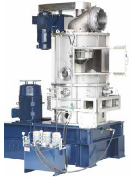
› Drymeister® (DMR-H) flash dryer (continuous)

The Drymeister® (DMR-H) continuous flash dryer is able to handle slurries, pastes and filter cakes. The DMR-H ensures a dry product where moisture content and particle size are