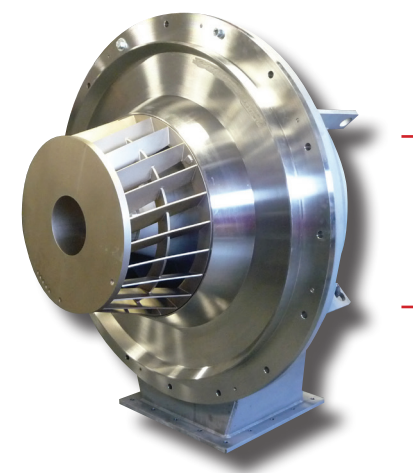
Classifier assembly for Mikro® E-ACM